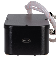
NGM, 220-240V 50-60HZ ME