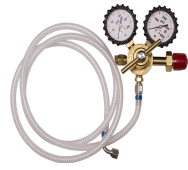
KIT, PRIMARY N2 REGULATOR