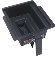
FUNNEL W/DECAL,PPK NAR BLK(LG)