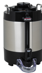
TF SERVER, 1.5G/5.7L MECH NOBASE