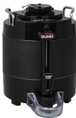
TF SERVER, 1G/3.8L MECH BLK NOBASE