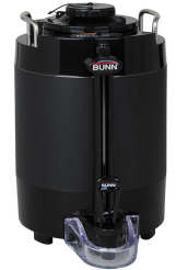
TF SERVER, 1.5G/5.7L MECH BLK NOBASE