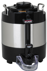
TF SERVER, 1G/3.8L MECH NOBASE