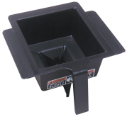
FUNNEL W/DECAL, PPK NAR BLK (SM)