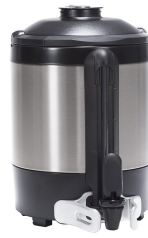
TF SERVER, 1.5G MECH NOBASE GEN3