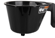
FUNNEL ASSY, SMART COFFEE BLK-CLEARED