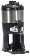
TF SERVER, 1G DSG GEN3