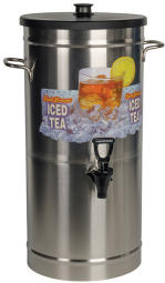
TDS-3.5, 3.5 GAL