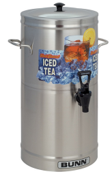
TDS-3, 3 GAL

Product #: 32130.0100 6 Mfr#:SVAP-3000F-N