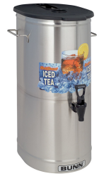
TDO-5, RESERVOIR, BREW THRU