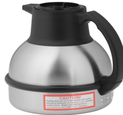
THERMAL CARAFE, ORN 1.9L 12PK