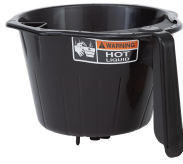
FUNNEL ASSY, SMART COFFEE BLK-CLEARED