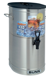
TDO-4, RESERVOIR BREW THRU