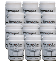
MILK SYS CLEANING TABLETS (12/CS)