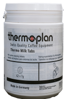
TABLETS, 62 MILK SYSTEM CLEANING -1 JAR