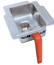
FUNNEL ASSY,SST-PP ORANGE HDL