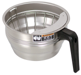
FUNNEL ASSY, SST-BLK HDL(7.12)