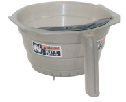
FUNNEL W/DECALS, WIDE-SMOKE