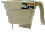
FUNNEL AY, QUICK BREW(TW)