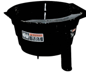
FUNNEL ASSY,BLK- CENTER OUTLET