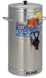
TDS-3, 3 GAL