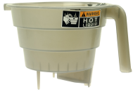
FUNNEL ASSY, TEA (TU3/T3)