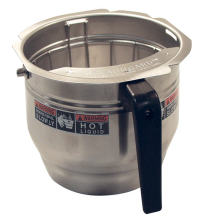
FUNNEL AY,W/DECAL GRT "C"7.12