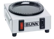
STOVE, WX1 120V/100W