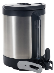
SH SERVER, 1.5G/5.7L INF SERIES