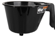
FUNNEL ASSY, SMART COFFEE BLK-CLEARED