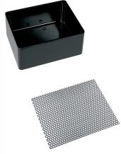
DRIP TRAY KIT (2.5"HT-HW2)