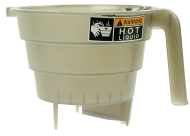
FUNNEL ASSY, TEA (TU3/T3)