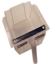
POUCHPACK FUNL ASSY,TEA Q-T