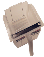
POUCHPACK FUNL AY, TEA S-T