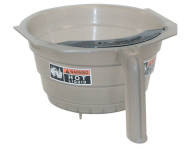
FUNNEL W/DECALS, WIDE-SMOKE