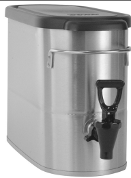
TDO-N-2.0 LP, RSVR W/ HEM