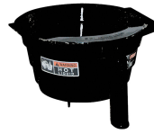
FUNNEL ASSY,BLK- CENTER OUTLET