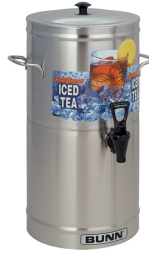
TDS-3, 3 GAL