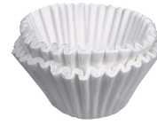
FILTERS TEA/SYS2 500PK/1 50/CL