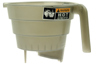
FUNNEL AY, QUICK BREW(TW)