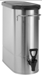
TDO-N-3.5 LP, RSVR W/ HEM