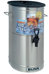
TDO-4, RESERVOIR BREW THRU