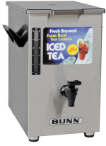
TD4, SIGHT GAUGE SWT/UNSWT HDL