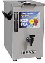
TD4, BREW THRU LID SWT/UNSWT HDL