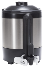
TF SERVER, 1.5G MECH NOBASE GEN3