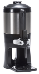
TF SERVER, 1.5G MECH GEN3