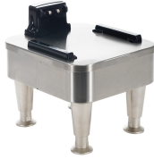
1SH STAND, 120V INF SERIES