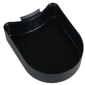
DRIP TRAY, TDO-N