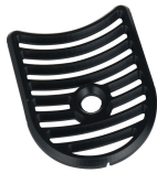
COVER, DRIP TDO-N