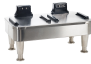
2SH STAND, 120V INF SERIES