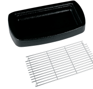
DRIP TRAY KIT, ITB W/2 TDO-N-3.5