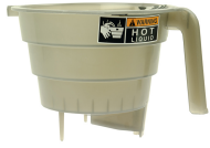
FUNNEL ASSY, TEA (TU3/T3)