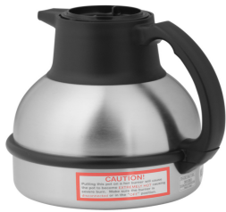
THERMAL CARAFE,ORN 1.9L 12PK