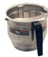
FUNNEL AY,W/DECAL GRT "C"7.12