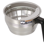
FUNNEL ASSY, SST-BLK HDL(7.12)