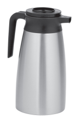
PITCHER,SST 1.9L TALL-6/CASE

Product #: 39430.0000 6 Mfr#:SVP-1901DSG