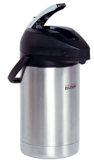
AIRPOT, 3.0L SST LA 6/ CASE

Product #: 32130.0000 6 Mfr#:SVAP-3000F-N