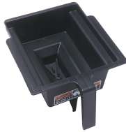
FUNNEL W/DECAL,PPK NAR BLK(LG)