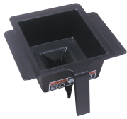
FUNNEL W/DECAL,PPK NAR BLK(SM)