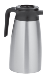
PITCHER,SST 1.9L TALL- SNGL PK

Product #: 39430.0000 6 Mfr#:SVP-1901DSG