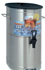
TDO-4, RESERVOIR BREW THRU