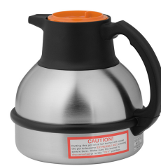
THERMAL CARAFE, ORN 1.9L 1PK