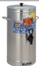
TDS-3, 3 GAL