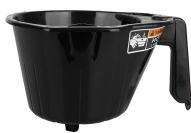
FUNNEL ASSY, SMART COFFEE BLK-CLEARED