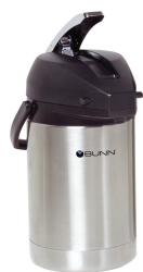
AIRPOT, 2.5L SST LA SINGLE PK