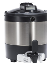
TF SERVER, 1G DSG GEN3 NOBASE