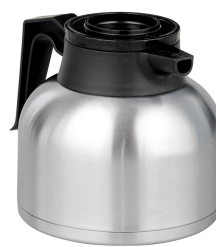
CARAFE, SST 1.9L SHRT BLK 1