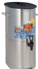
TDO-5, RESERVOIR, BREW THRU