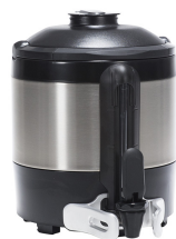
TF SERVER, 1G MECH GEN3 NOBASE