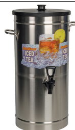
TDS-3.5, 3.5 GAL