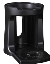
STAND ASSY KIT, TF SERVER