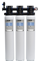
SYSTEM, WQ-TRPL60 (10.5).2CL