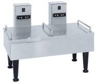
2SH STAND, 120V