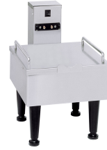
1SH STAND, 120V