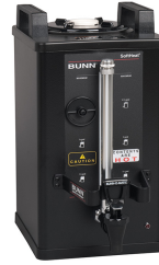
SH SERVER, 1.5G BLK 60 MIN ADJ TMR