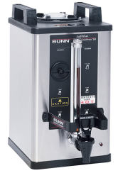
SH SERVER, 1.5G 120 MIN ADJ TMR AUTO OFF