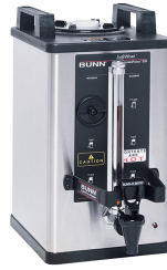
SH SERVER, 1.5G/5.7L 45 MIN ADJ TMR