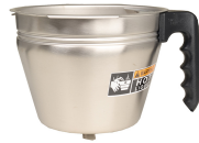
FUNNEL ASSY, W/ INSERTS SMTF