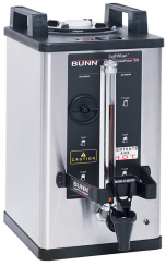
SH SERVER, 1.5G/5.7L 240 MIN ADJ TMR