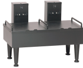
2SH STAND, 120V BLK