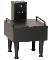
1SH STAND, 120V BLK