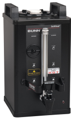
SH SERVER, 1.5G/5.7L BLK 120 MIN ADJ TM