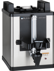
SH-S SERVER 1G 60 MIN ADJ TMR