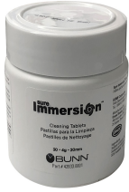
TABLET, CLEANING 1 JAR SURE IMMERSION