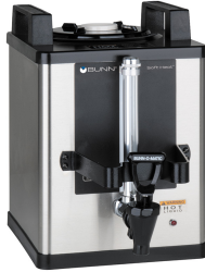
SH-S SERVER 1G 60 MIN ADJ TMR