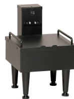
1SH STAND, 120V BLK