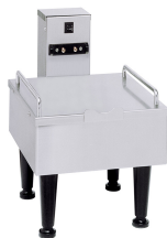
1SH STAND, 120V