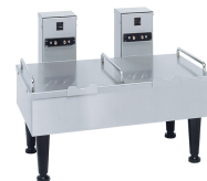
2SH STAND, 120V