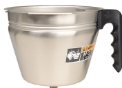
FUNNEL ASSY, W/ INSERTS SMTF