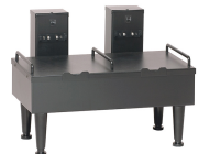
2SH STAND, 120V BLK