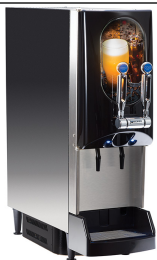
NITRON, 120V NITRON-2 W/RGD & NGM