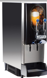
NITRON, 120V NITRON-2 DN W/RGD & NGM