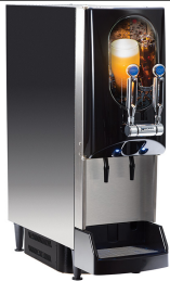
NITRON, 120V NITRON-2 W/RGD & NGM