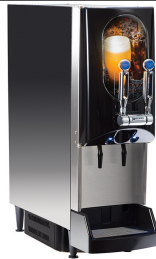
NITRON, 120V NITRON-2 DN W/RGD & NGM