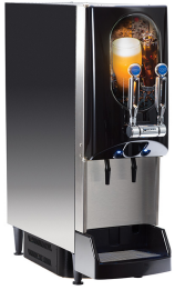
NITRON, 120V NITRON-2 W/RGD & NGM