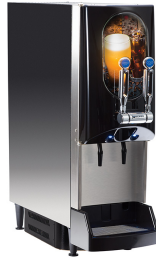
NITRON, 120V NITRON-2 DN W/RGD & NGM