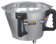
FUNNEL ASSY W/ BASKET, TITAN