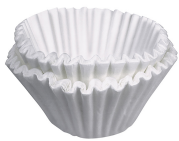
FILTERS, 20x8 252/CS 36/CL