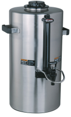
TITAN TF SERVER, VERTICAL FCT