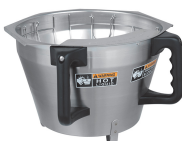
FUNNEL ASSY W/ BASKET, TITAN