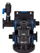
HEAD ASSEMBLY, WQ-SINGLE