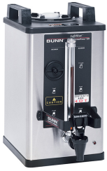
SH SERVER, 1.5G/5.7L 240 MIN ADJ TMR