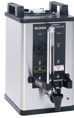
SH SERVER, 1.5G/5.7L 45 MIN ADJ TMR