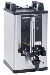
SH SERVER, 1.5G 120 MIN ADJ TMR AUTO OFF