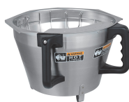
FUNNEL ASSY W/ BASKET, TITAN