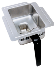
FUNNEL ASSY, SST-PP BLK HNDL