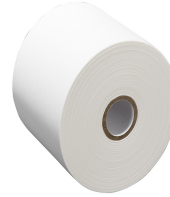
FILTER, PAPER 1 ROLL