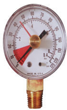
GAUGE, WATER FILTER EQHP