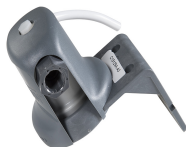
WATER FILTER HEAD, EQHP-VHD