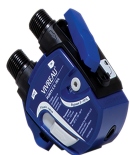
WATER FILTER HEAD, C300 & C500 PURCHASED