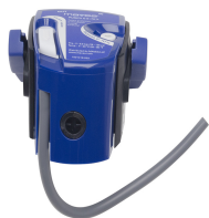
WATER FILTER HEAD, C300 & C500 PURCHASED