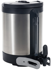
SH SERVER, 1.5G/5.7L INF SERIES