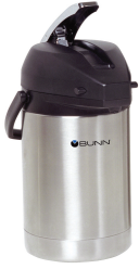
AIRPOT, 2.5L SST LA SINGLE PK