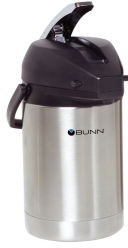
AIRPOT, 2.5L SST LA 6/ CASE