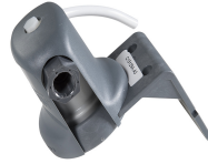
WATER FILTER HEAD, EQHP-VHD