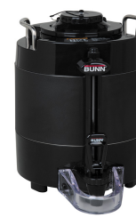
TF SERVER, 1G/3.8L MECH BLK NOBASE