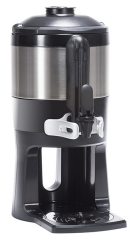
TF SERVER, 1G MECH GEN3