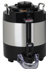
TF SERVER, 1G/3.8L MECH NOBASE