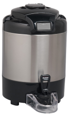
TF SERVER, DSG2 1.5G SST NOBAS