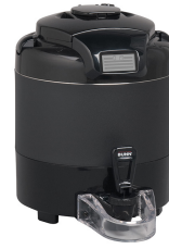
TF SERVER, DSG2 1G BLK NOBASE