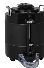
TF SERVER, 1G/3.8L MECH BLK NOBASE