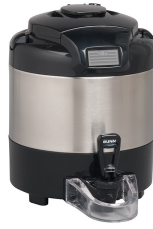
TF SERVER, DSG2 1G SST NOBASE

Product #: 36725.0100 6 Mfr#:SVAP-3800F-N