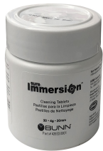
TABLET, CLEANING 1 JAR SURE IMMERSION