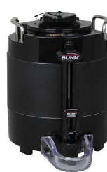
TF SERVER, 1G/3.8L MECH BLK NOBASE