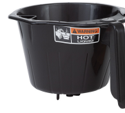
FUNNEL ASSY, SMART COFFEE BLK-CLEARED