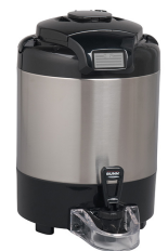
TF SERVER, DSG2 1.5G SST NOBAS