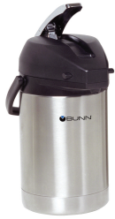
AIRPOT, 2.5L SST LA SINGLE PK

Product #: 32125.0000 6 Mfr#:SVAP-2500F-N