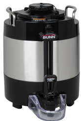
TF SERVER, 1G/3.8L MECH NOBASE