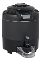
TF SERVER, DSG2 1G BLK NOBASE