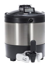
TF SERVER, 1G DSG GEN3 NOBASE