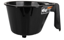
FUNNEL ASSY, SMART COFFEE BLK-CLEARED