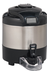
TF SERVER, DSG2 1G SST NOBASE

Product #: 36725.0100 6 Mfr#:SVAP-3800F-N