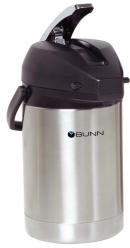
AIRPOT, 2.5L SST LA 6/ CASE

Product #: 32125.0000 6 Mfr#:SVAP-2500F-N