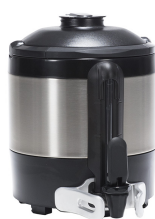
TF SERVER, 1G MECH GEN3 NOBASE