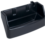
TRAY, EXTENDED DRIP JDF-4S