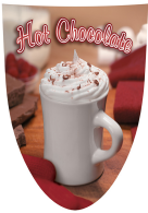
DISPLAY, GRAPHICS HOT CHOC