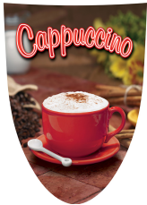
DISPLAY GRAPHICS IMIX-3