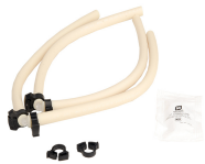
TUBE KIT, .188 PUMP LCC/LCA